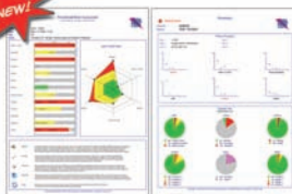
RISK ASSESS. PT. SUMMARY

← automatically trends data to track clinical endpoints