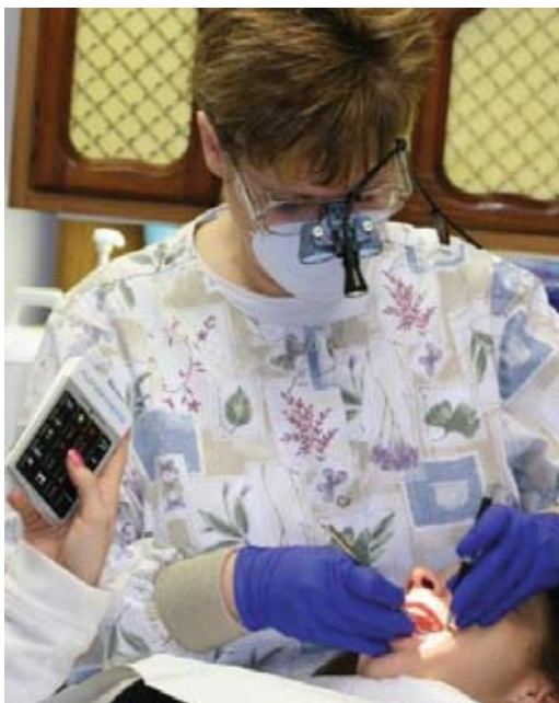
The Go-Probe Wireless Keypad is so easy to use, you can even ask the patient to input the numbers as you probe.

Florida Probe understands the breakdowns and frustrations clinicians face while attempting to maintain the standard of care in their offices and has come up with a solution to these issues. The solution is “Go-Probe.”