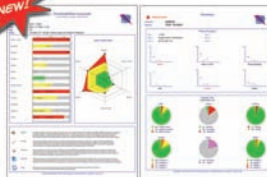
RISK ASSESS. PT. SUMMARY

← automatically trends data to track clinical endpoints